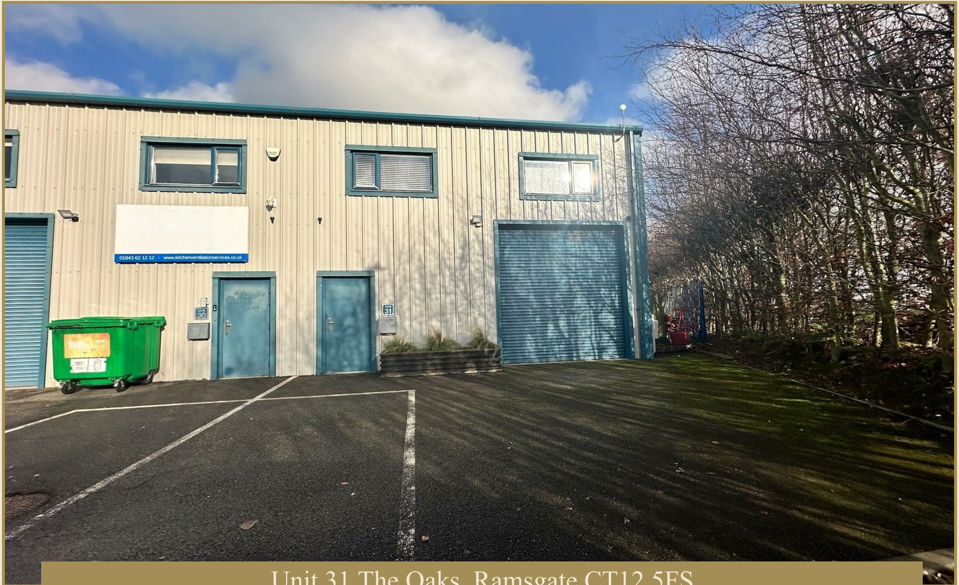
Unit 31 The Oaks, Ramsgate CT12 5FS